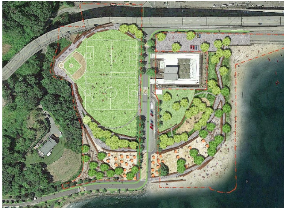
Figure 3: Proposed design - vision plan

Cole Eckerman , Citizens for Off-Leash Areas (COLA), Stated that COLA is very concerned that if an off-leash area is not built during phase I of construction then it will not happen. Ms. Eckerman stated other projects that have promised off-leash areas but have yet to be constructed. Cole Eckerman then stated that while district 7, where