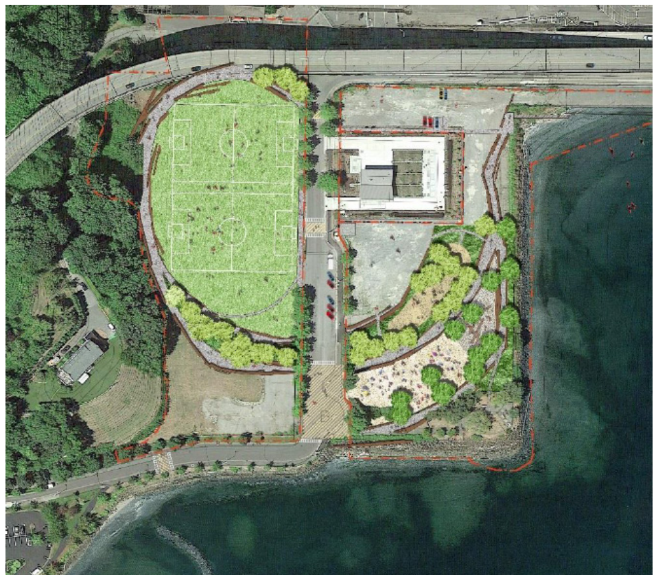
Figure 4: Proposed design - Phase I